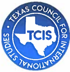
Exhibit "A" 2022-2023 TCIS INSTRUCTIONAL CALENDAR